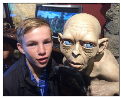
Can you see the family resemblance?

We believe that Kāhu Class have all thoroughly enjoyed their week in the Capital. No doubt they will need plenty of sleep this weekend!