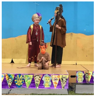
Kereru & Kea kids were treated to seeing Poukawa Schools production of Ali Baba and the Bandits last week. Unfortunately it was rained off before the final scene.