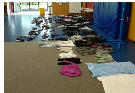
Christmas Riddle: What takes up half a hall and smells like old socks?

Carols by Candlelight @ Christ Church Pukehou Saturday 22nd December 7.30pm Candles provided, shared supper afterwards Collection for the CHB food bank