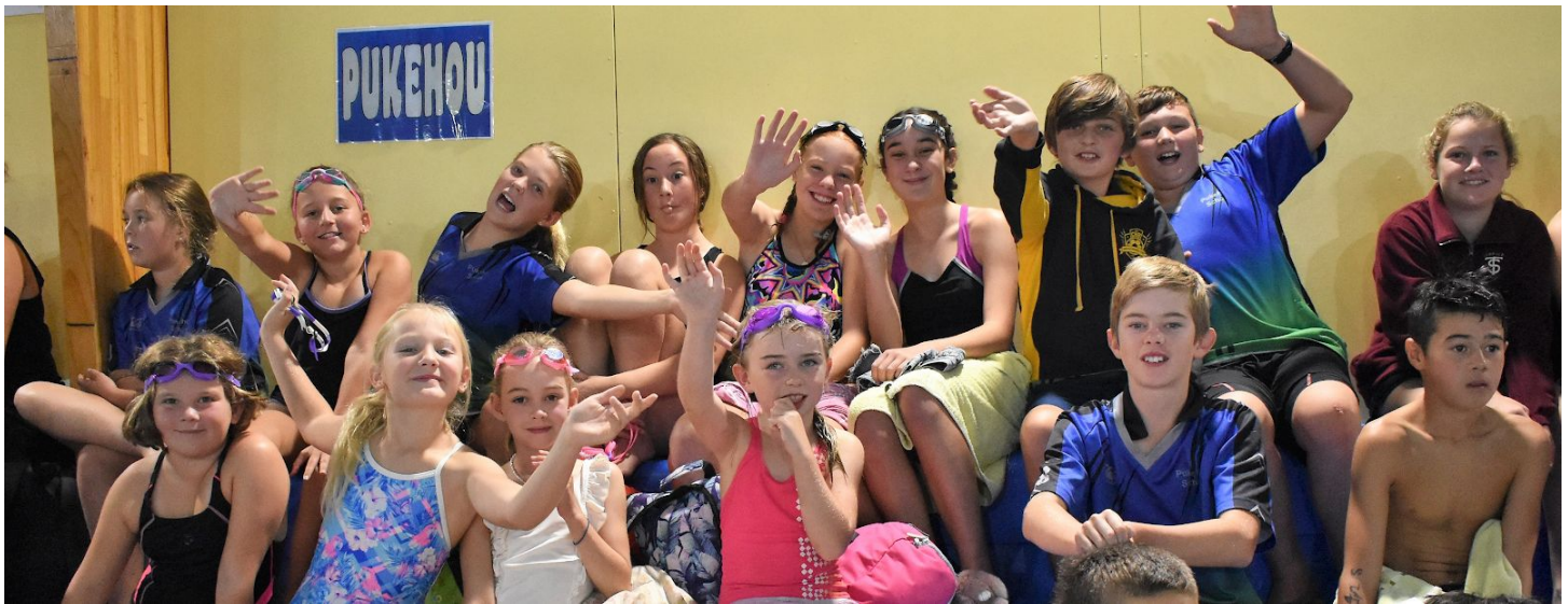
Some of the 23 strong Pukehou Inter-School swimming team, supporting each other at the AW Parsons Indoor Pool.