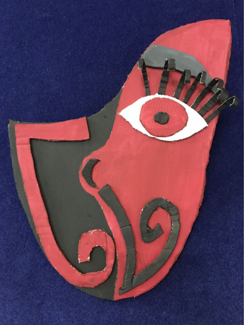
Naomi Yr 7