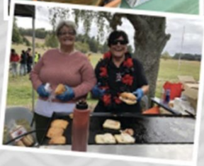
Fundraising for House Gazebos