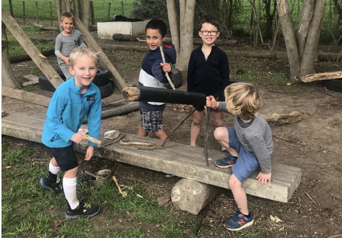
Kereru kids being creative.

The next game is scheduled for Friday 3rd September. Watch this space for any updates.