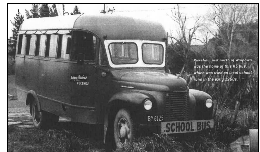
Pukehou, just north of Waipawa was the home of this K5 bus which was used as local school buses in the early 1960s.