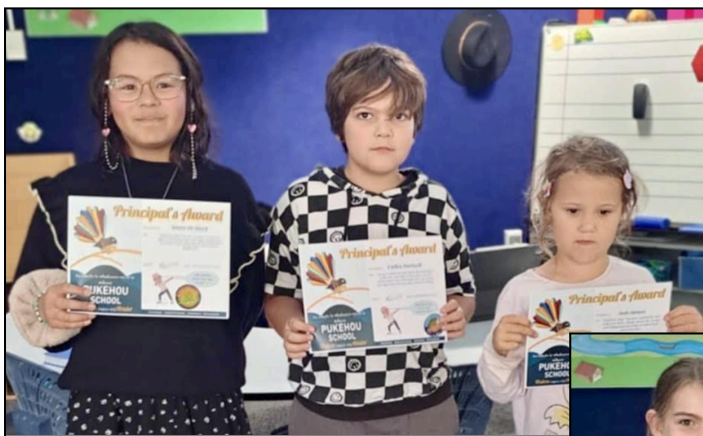
Proud recipients at our first 2025 Assembly, yesterday.