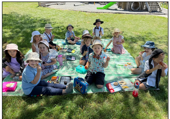
Kererū's Art Deco Picnic.