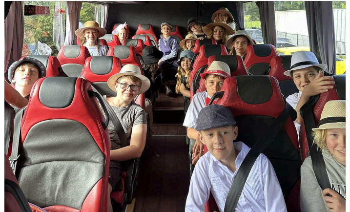
On our Junior Gatsby trip today.