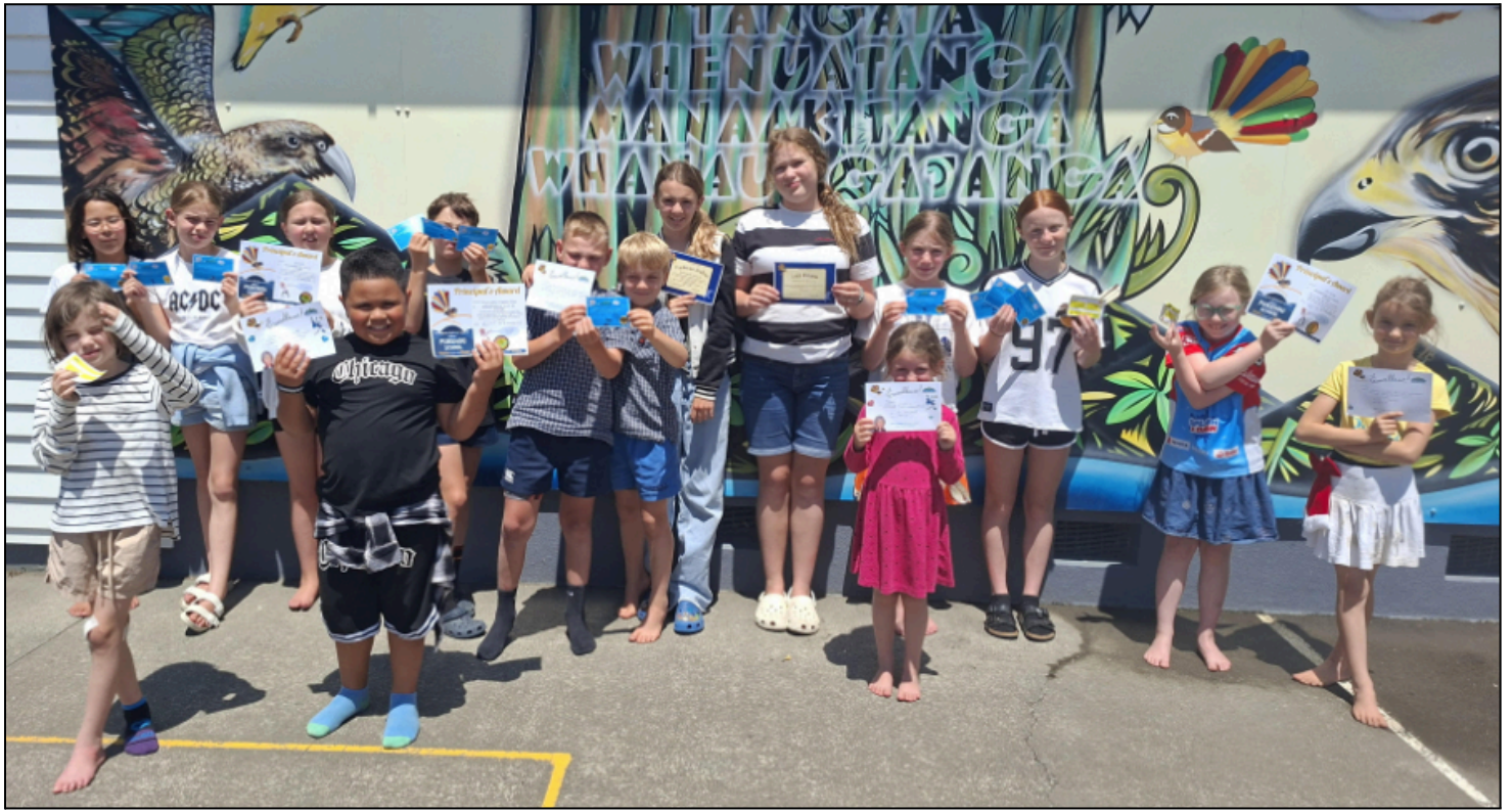
There were so many recipients of certificates at assembly yesterday. Ka pai! Keep up the good work!